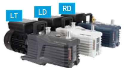
Vector LD and LT also available for laboratory applications

JAVAC products are available direct from our website and from a select range of Authorised Distributors.