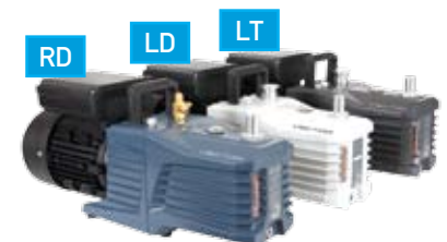
Vector RD also available for commercial refrigeration applications